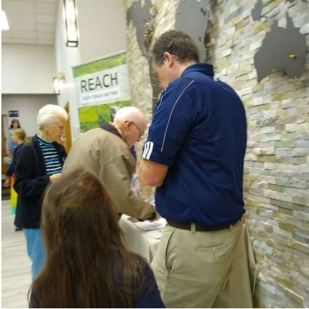
Sharing ministry and literature at HBC