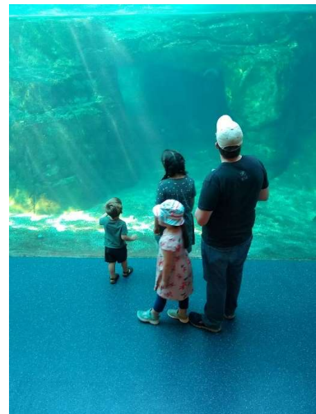
Anniversary stop by Riverbanks Zoo in SC