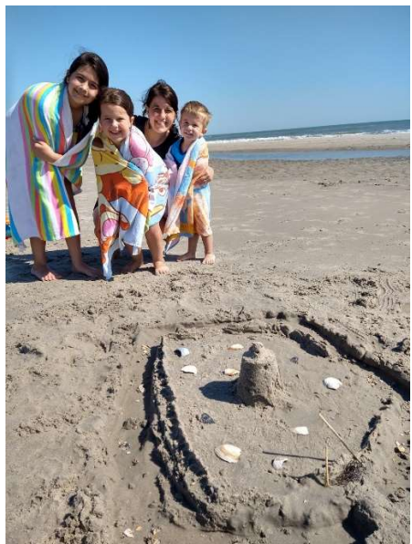
Just warm enough to enjoy Jersey Shore