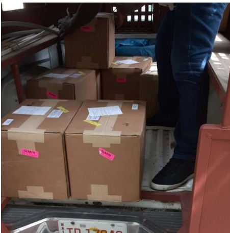
Boxes inconspicuously delivered in Haiti