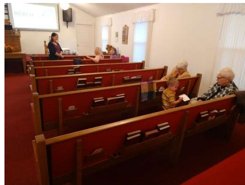
Long-awaited visit in person to WV mountains