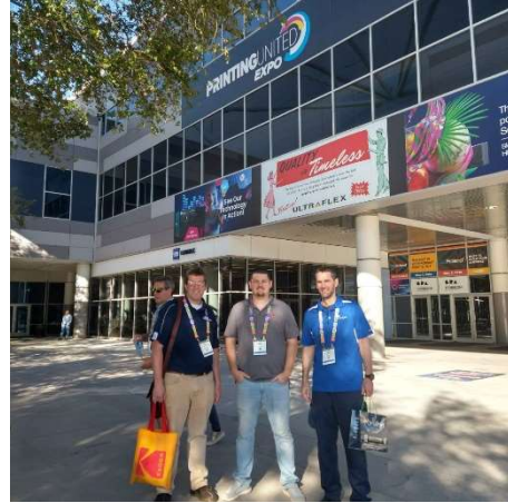
Outside NV convention center for print show