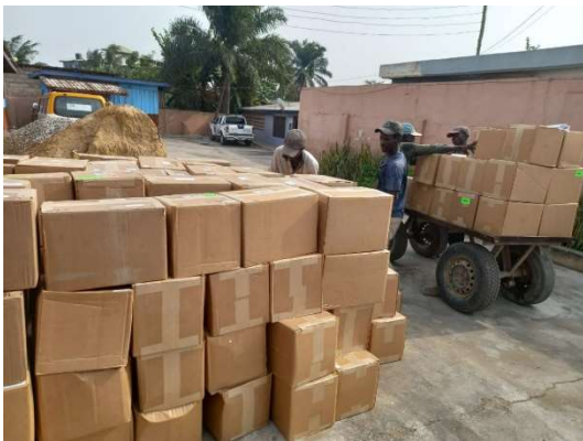
Boxes unloaded & sorted on arrival in Ghana