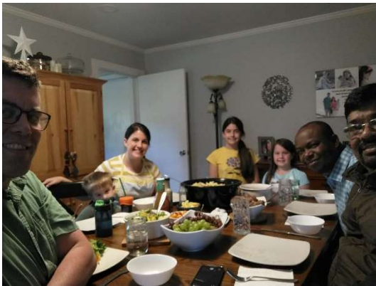
New friends around the table & the world