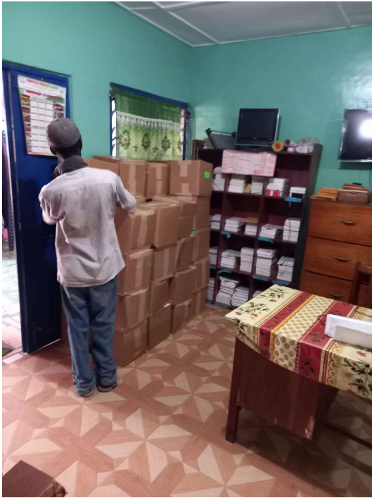
Lessons staged for use in Ghana branch office