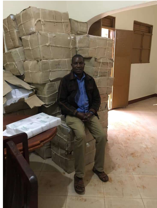
Bulk lessons received in Uganda from Kenya

"Finally, brothers, pray for us, that the word of the Lord may speed ahead and be honored . . . For not all have faith. But the Lord is faithful . . ." (2 Thessalonians 3:1-5)