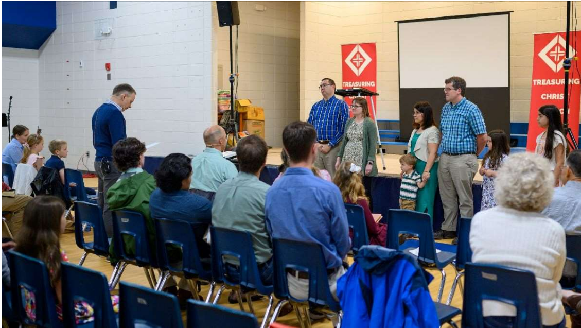
Us among those covenanting with and joining in membership at Treasuring Christ Church in GA