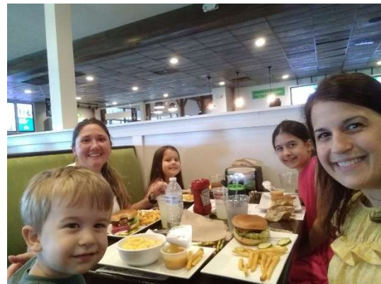
English/Spanish conversation over GA food