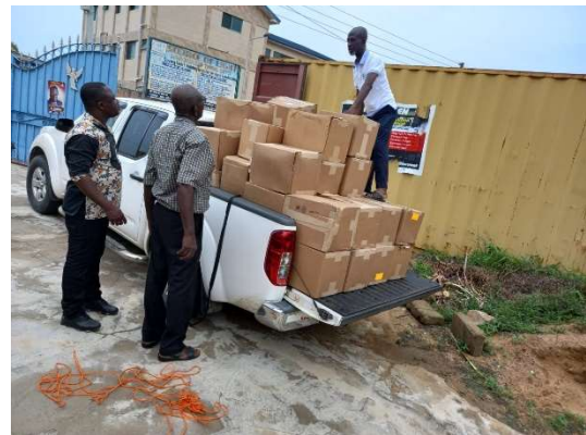
Transfer by various means across W. Africa